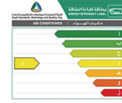
ASSA18UUTAZ ASSA24UUTAZ ASSA30UUTAZ ASSA36UUTBZ