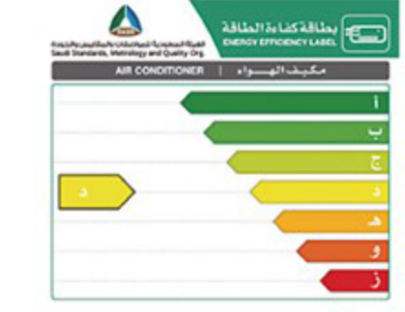
ASSA18FUTAZ ASSA24FUTAZ ASSA30FUTAZ ASSA36FUTBZ