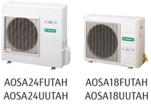
AOSA24FUTAH AOSA24UUTAH AOSA18FUTAH AOSA18UUTAH