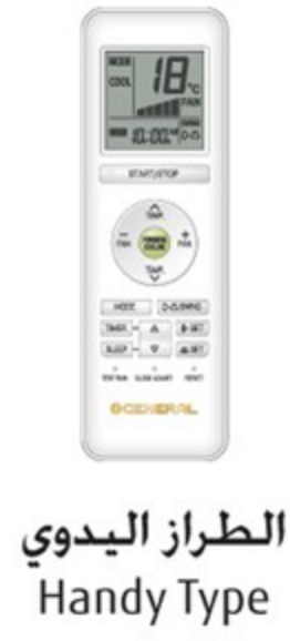
الطراز اليدوي Handy Type