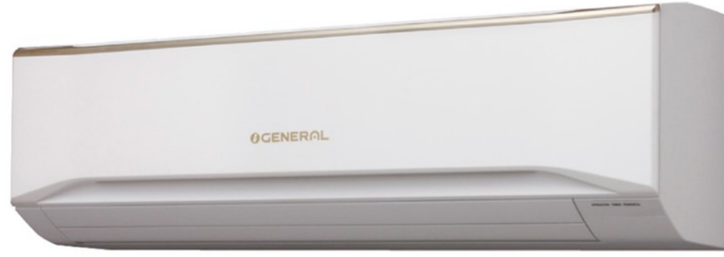
ASSA18UUTA / ASSA24UUTA / ASSA30UUTA / ASSA36UUTB ASSA18FUTA / ASSA24FUTA / ASSA30FUTA / ASSA36FUTB