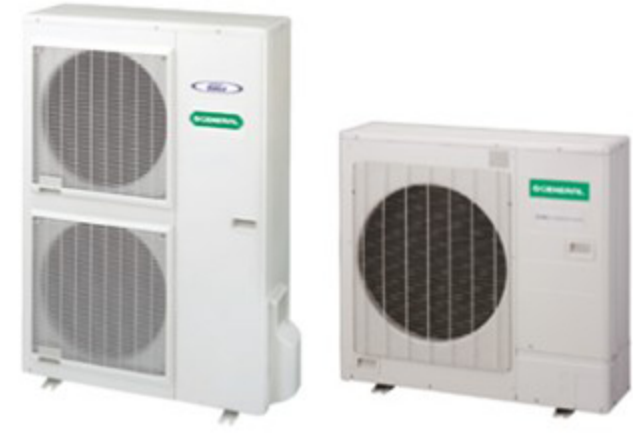
AOSA36FUTBS AOSA30FUTAS AOSA36UUTBS AOSA30UUTAS